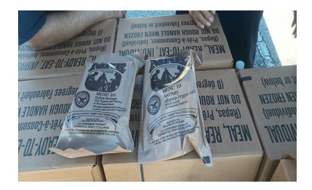
Faith In Action Events/Opportunities