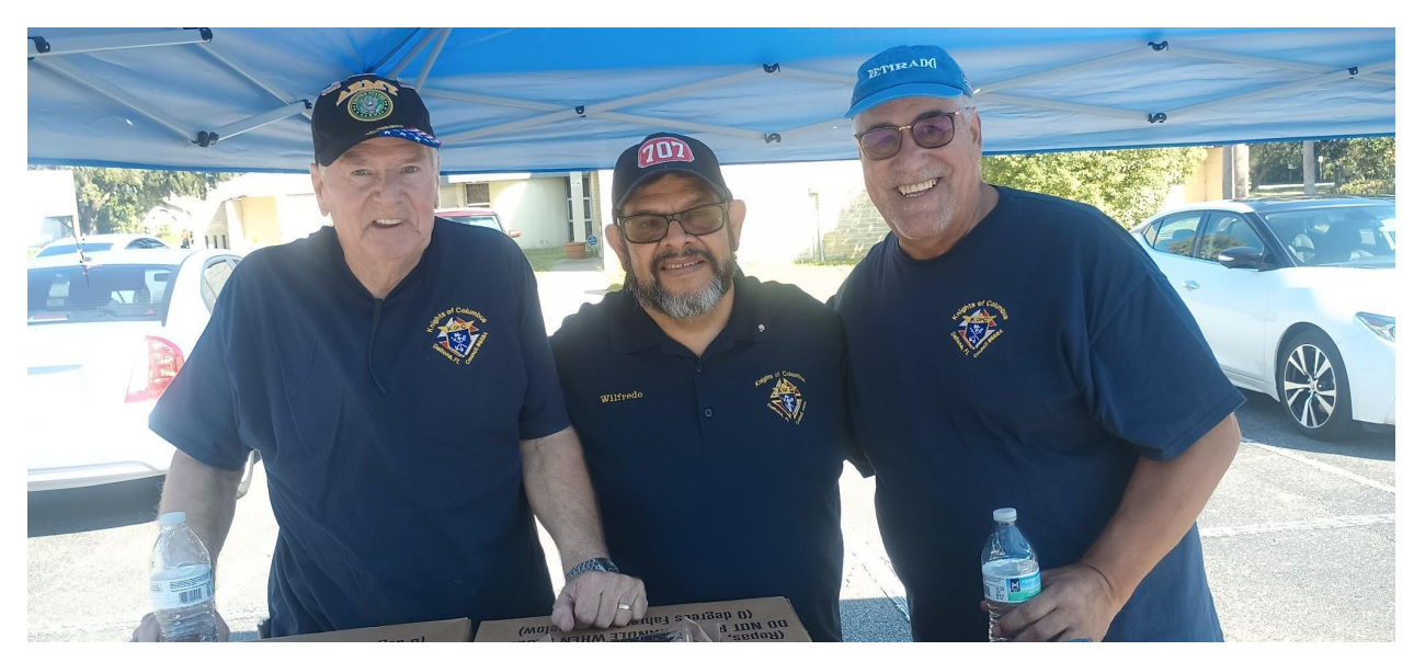
Hurricane Milton's Aftermath: Knights Come to the Rescue

On Monday, October 14th, 2024, from 8:00 AM to 4:00 PM, the Knight of Columbus Council 6584 Deltona, FL, in collaboration with St. Vincent de Paul Our Lady of the Lakes Conference, provided essential emergency food (MREs) and water distribution services to the local community. The event took place in partnership with Catholic Relief Services, which played a crucial role in supporting this initiative.